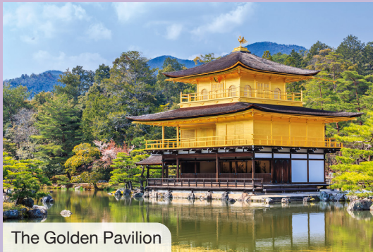
The Golden Pavilion

It is a Zen Buddhist temple extending out into a pond in a strolling garden of ponds, bridges and plants, rock formations and small islands.