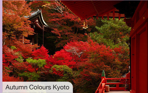
Autumn Colours Kyoto

Kyoto, nestled among three mountain ranges, adorned with bamboo groves and cherry trees, home to ancient shrines, pagodas and gardens, is a delight to any traveller who graces the ancient pathways and modern streets of this charming city.