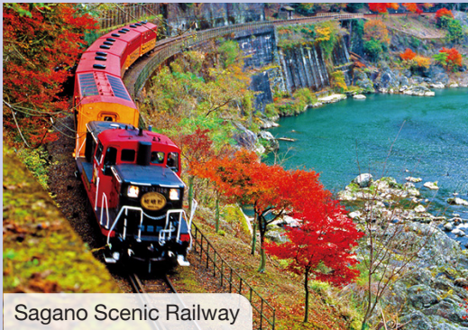
Sagano Scenic Railway

This charming, old fashioned train winds its way through the mountains at a relatively slow pace, taking about 25 minutes to make the seven kilometer journey and giving passengers a pleasant view of the scenery as they travel from Arashiyama through the forested ravine and into rural Kameoka.