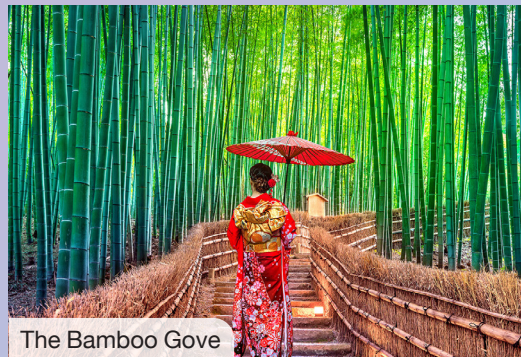
The Bamboo Grove

The Arashiyama Bamboo Grove is a natural forest of bamboo. It is one of the most photographed sights in the city. But no picture can capture the feeling of standing in the midst of this sprawling bamboo grove - it must be experienced.